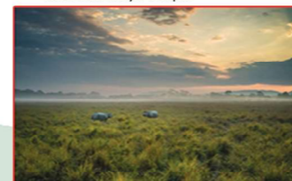
Kaziranga National Park